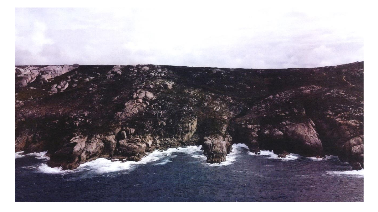
Photo 1: View of the rocks near where Damien went missing<sup>18</sup>

9. On 27 February 2021, Damien and his brother Caleb, his nephew Jye, and his cousin Russell<sup>12,13</sup> went fishing off coastal rocks near Cheynes in the Waychinicup National Park, about 68 km east of Albany.<sup>14,15,16</sup> The terrain in the area is rugged and rocky (see: Photo 1). The rocks are covered with black algae and waves that crash onto the rocks make them slippery and dangerous (see: Photos 2 and 3).<sup>17</sup>